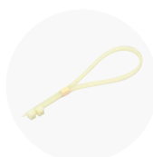
2x plastic straps