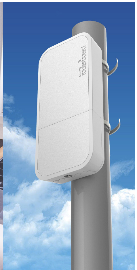
On the pole