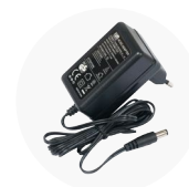
24V 0.8 A Power adapter