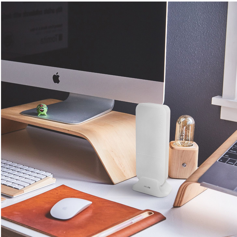
For home use