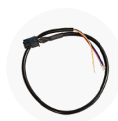
0.35m 4pin Automotive adapter cable